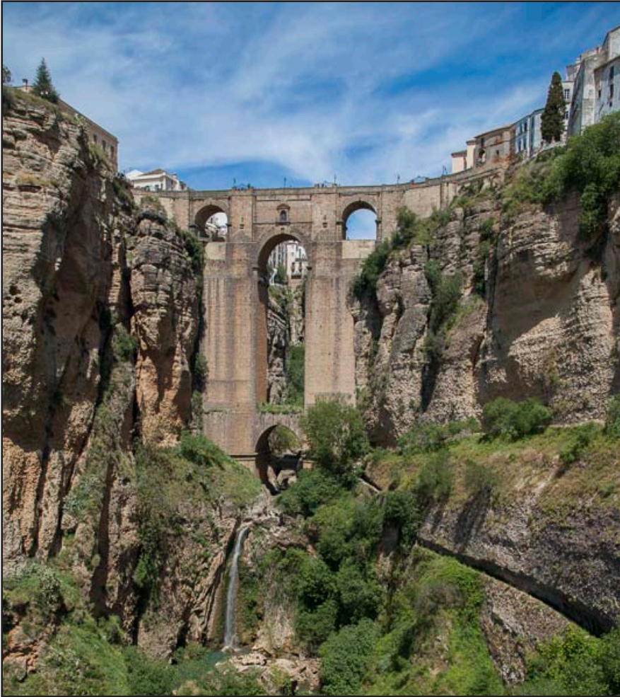
The Famous View Of Ronda....