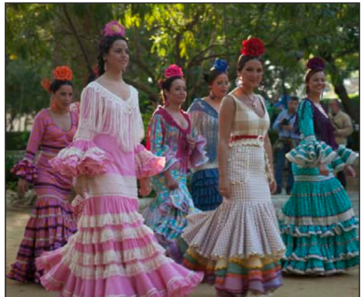
Our Welcome To Ronda Fashion Show...