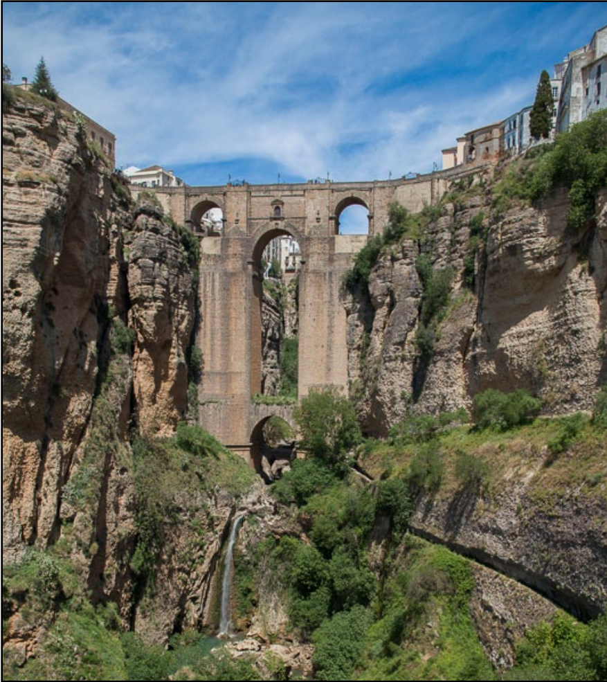
The Famous View Of Ronda....