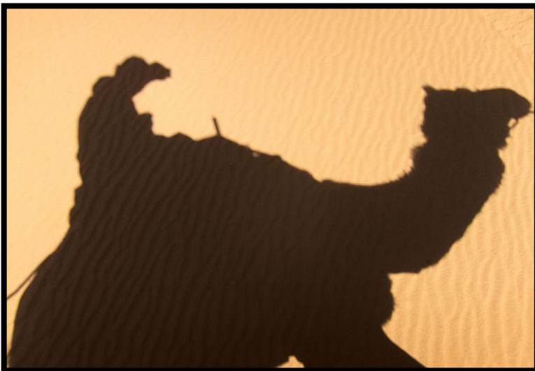
Tourist on Camel... (Self Portrait...)